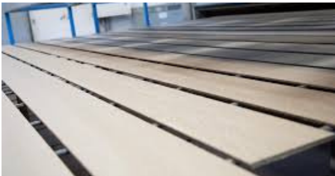
INSIDE MIDWEST FACTORY FINISHES

Inside the plant, controlled application of paint is applied to the siding. This eliminates negative factors like sunshine, wind or rain which can greatly impact paint application consistency and drying. The siding is then allowed to completely dry before carefully packaging for shipment.